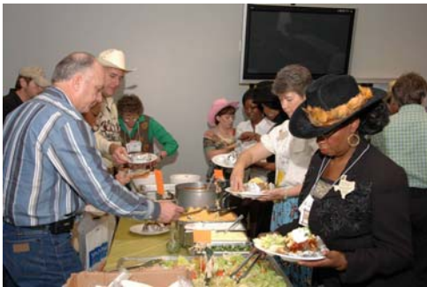
Chow Time included a breakfast tacos, build your own baked potato lunch, and barbecue beef sandwiches for dinner.