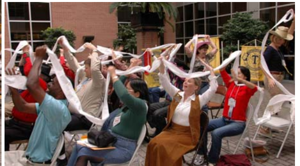
Pitts Corral was the perfect place for Stick Pony Races (at left) and the Out House Relay (pictured above). Clubs were also encouraged to bring their banners to display in Pitts Corral.