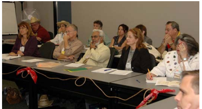
Conference attendees participate in one of the nine education sessions.