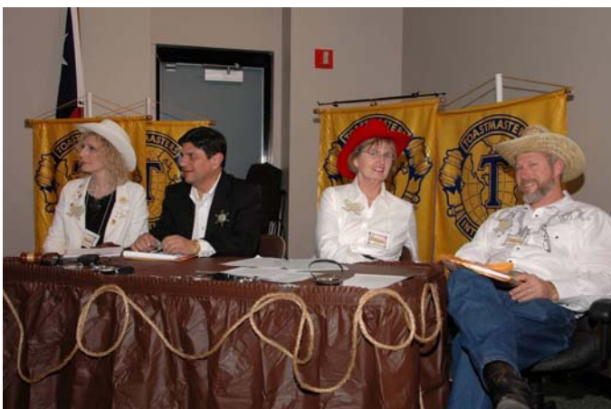
The top district officers conduct the fall business meeting from the front of the E.B. Cape auditorium.