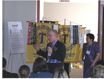
Parade of Banners